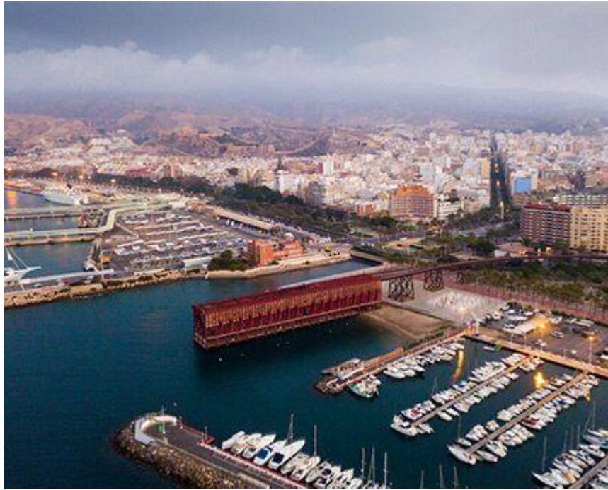
Province of Almería: beaches